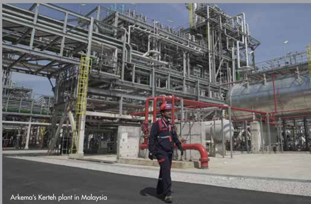
Arkema's Kerteh plant in Malaysia

CECA Watan Saudi Arabia Jeddah Street, 2nd Industrial Area Dammam Tel: (+971) 4 457 2775 arkema.com