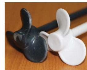
(left) worn epoxy coated impeller (right) Rilsan® PA11 coated impeller